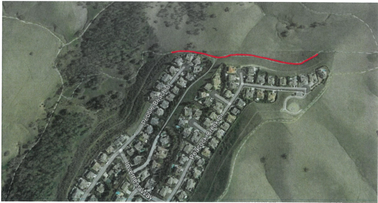
Decomposed gravel Trail reconstruction end of Peacock Ck [7306] $100,000