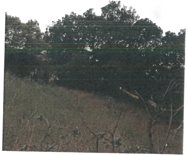
Before Trimming – behind Miwok Dr. and Blue Oak Dr. area